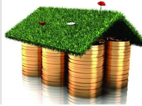
Before vs After